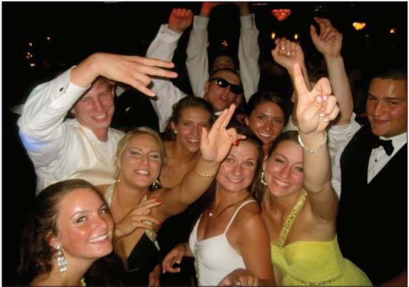
Seniors and Juniors celebrate prom together.