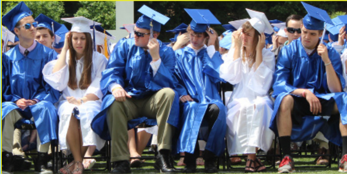
Seniors hold their caps down from the gusty wind.