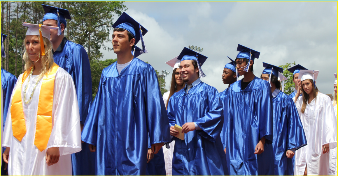
Seniors eagerly process onto the field as the 2012 Graduation Ceremony begins.